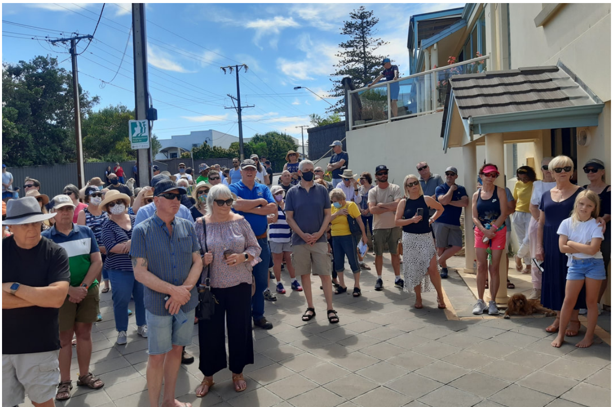
Wheatland St Shed Eyesore Rally Feb 2022