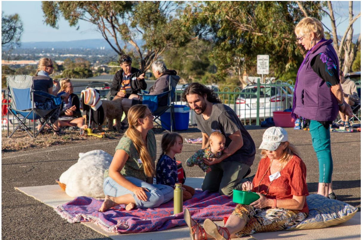
Neighbour day Event at McConnell Reserve 2022