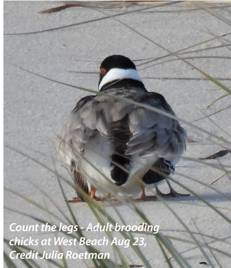
Count the legs - Adult brooding chicks at West Beach Aug 23

2 chicks fledged (reached 35 days old and should be able to fly) at Minda Beach on 5 Oct – the first recorded in the country this season – yet (unusually) remained with their parents throughout the incubation period of the next clutch. 3 further chicks hatched on 14 Nov but only survived 3 days (while the juveniles relocated temporarily to Edwards Street storm drain). The adults then visited Young Street drain and Hallett Cove but returned to Minda Beach 29 Nov and laid more eggs, due to hatch on New Year's Day, but sadly the entire nest was lost to sand inundation during Christmas storms.