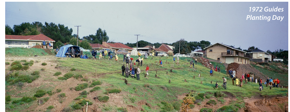
1972 Guides Planting Day