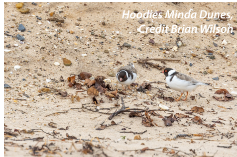
Hoodies Minda Dunes

With few exceptions, the public is very interested in the birds and supportive of temporary restrictions to protect breeding areas from disturbance, especially by unleashed dogs. Volunteers have devoted a huge amount of time monitoring sites and engaging with the public while Councils erected fences, signs, and banners on beaches – and undertook regular repairs after strong winds. Thanks also to Green Adelaide for supporting the Beach Nesting Birds Program.