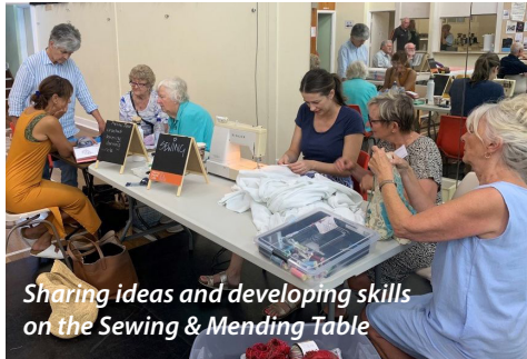
Sharing ideas and developing skills on the Sewing & Mending Table