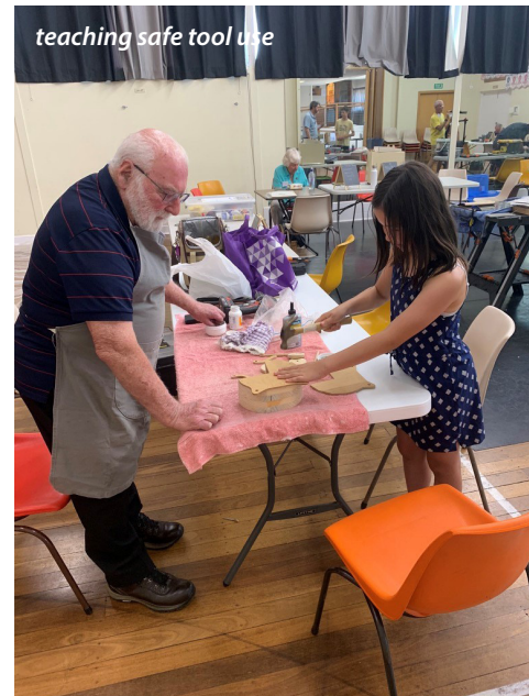
teaching safe tool use