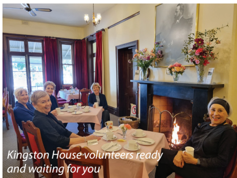
Kingston House volunteers ready and waiting for you

We are delighted to announce that bookings are now open for our annual High Tea to